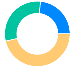
Protein Fat Carbs