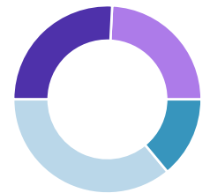
Breakfast Lunch Dinner Snack